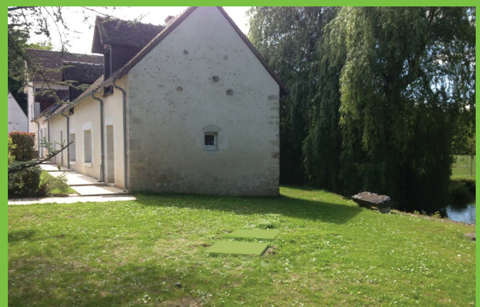
Tricel Novo FR11 installed showing two access covers