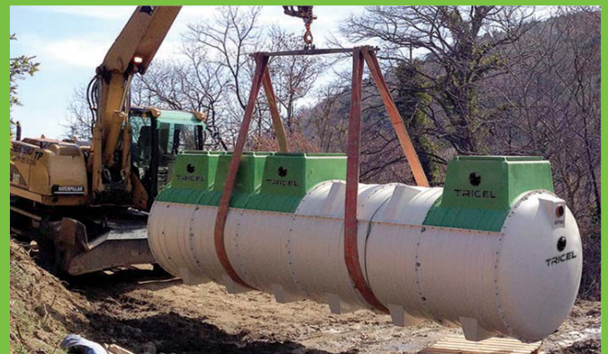
Installation of Tricel Novo FR20