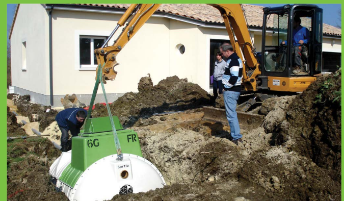
Installation of Tricel Novo FR6